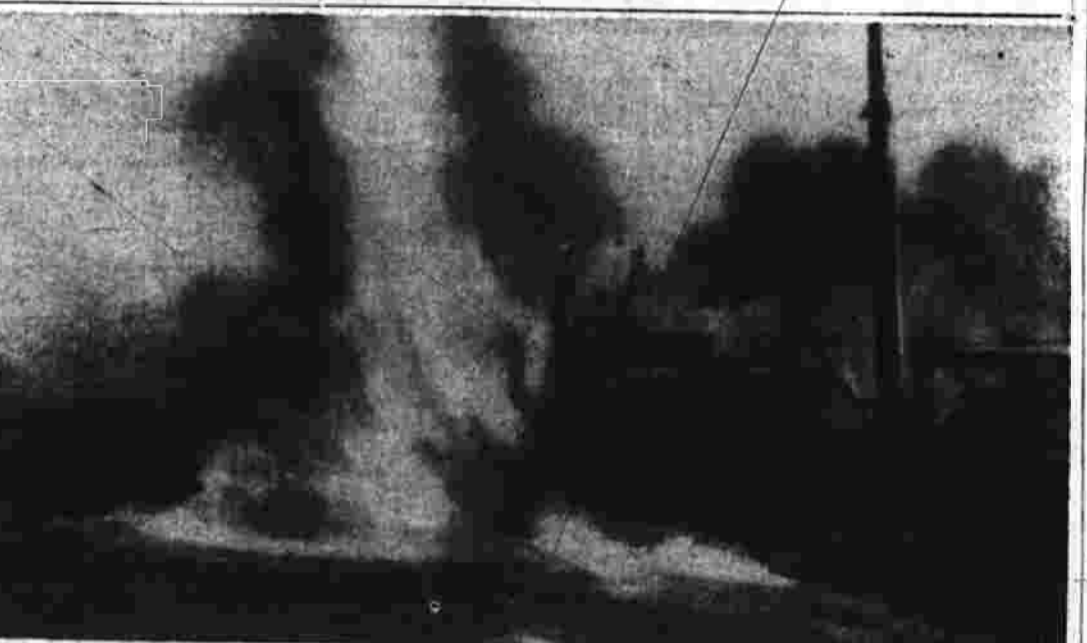
Moscow sources say these pictures show the Russian Baltic fleet has moved against German supply ships. Top: A torpedo strikes home. Bottom: A Nazi ship rolls over for its dive to the bottom.